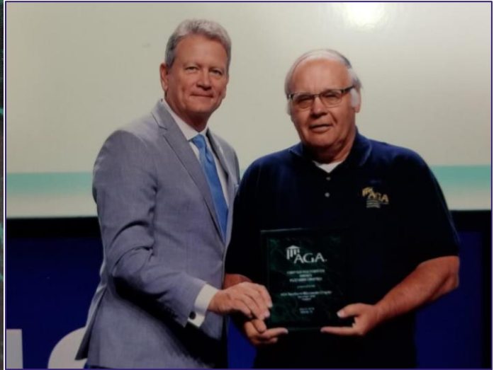
Left: Chapter Recognition plaque